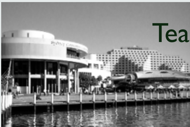
Darling Harbour Conference Centre