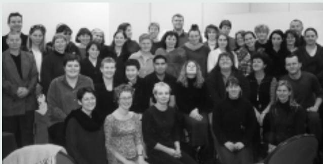
Delegates at the SLIANZ Conference